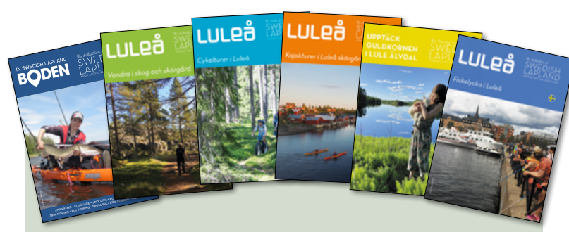
You can find more tips on activities in our themed guides to fishing, hiking, cycling and kayaking. Collect one at the tourist information office in Luleå or Boden, or download from visitlulea.se or bodeninswedishlapland.se.

The Vitå River runs from Gällivare Municipality down to the Råne-fjärden estuary. The Vitå River and its adjacent valley creates an alluring environment, displaying all the traits of a forest river on its way down to the sea. People have used the riverside lands as farmland and haymaking grounds and its rapids to power the mills at Vitåfors and Avafors. The Avafors blast furnace produced pig iron for the Vitåfors iron mill. This river has also been used for log driving.